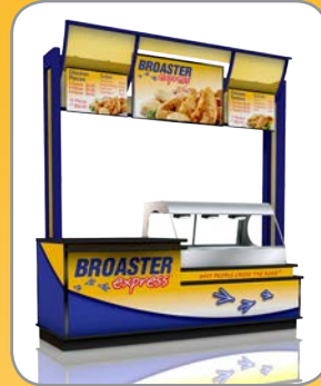
8' Unit, Left Orientation