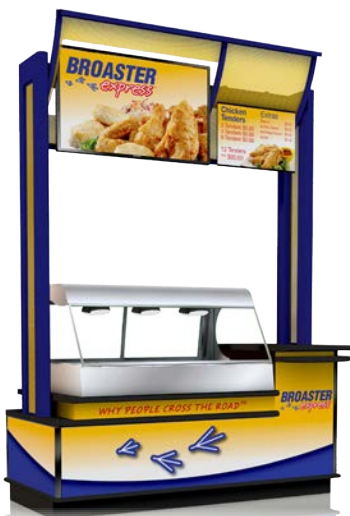
6' Unit, Right Orientation

Your authorized Broaster Distributor can assist you with placing your order for your Kiosk. Make your location a fully branded operation today!