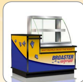
4' Unit, Left Orientation