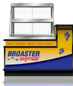
4' Unit, Right Orientation