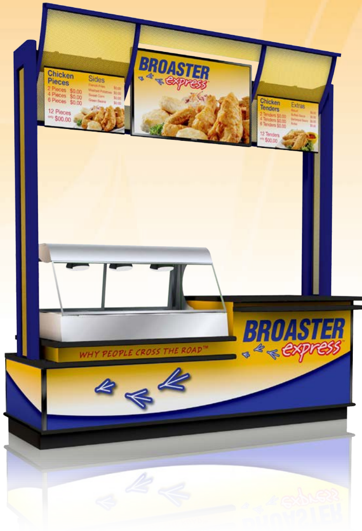
8' Unit, Right Orientation