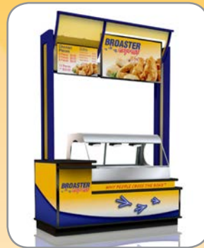
6' Unit, Left Orientation