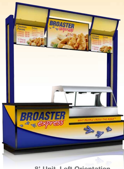
8' Unit, Left Orientation

Transform your foodservice operation into a fully branded, ready to serve kiosk station in just a few hours.