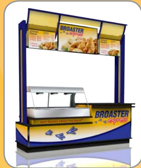
8' Unit, Right Orientation