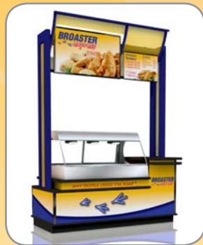
6' Unit, Right Orientation