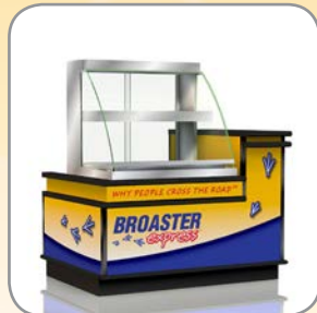
4' Unit, Right Orientation