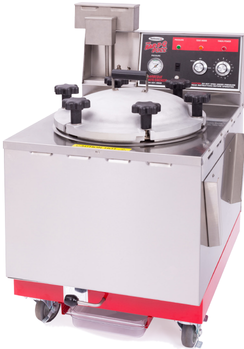
Shown with optional Water Baffle